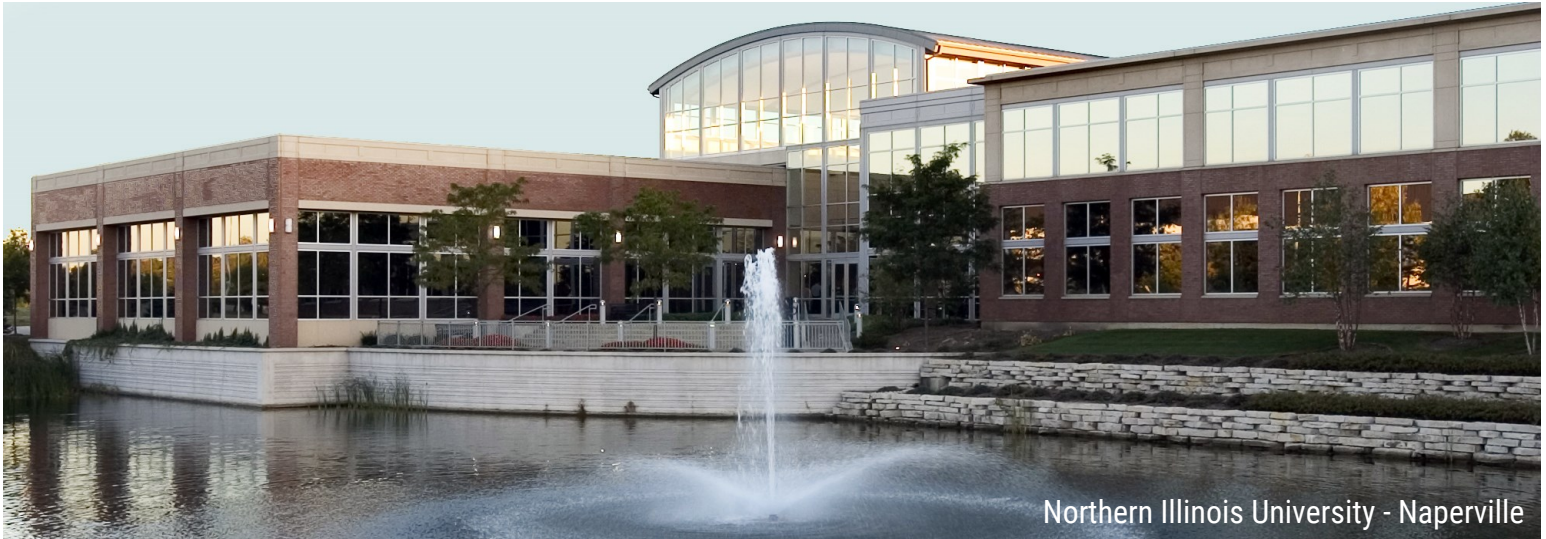
Northern Illinois University - Naperville

Attendees will include attorneys, legal analysts and assistants, county and township assessors, and staff from State of Illinois departments and agencies.