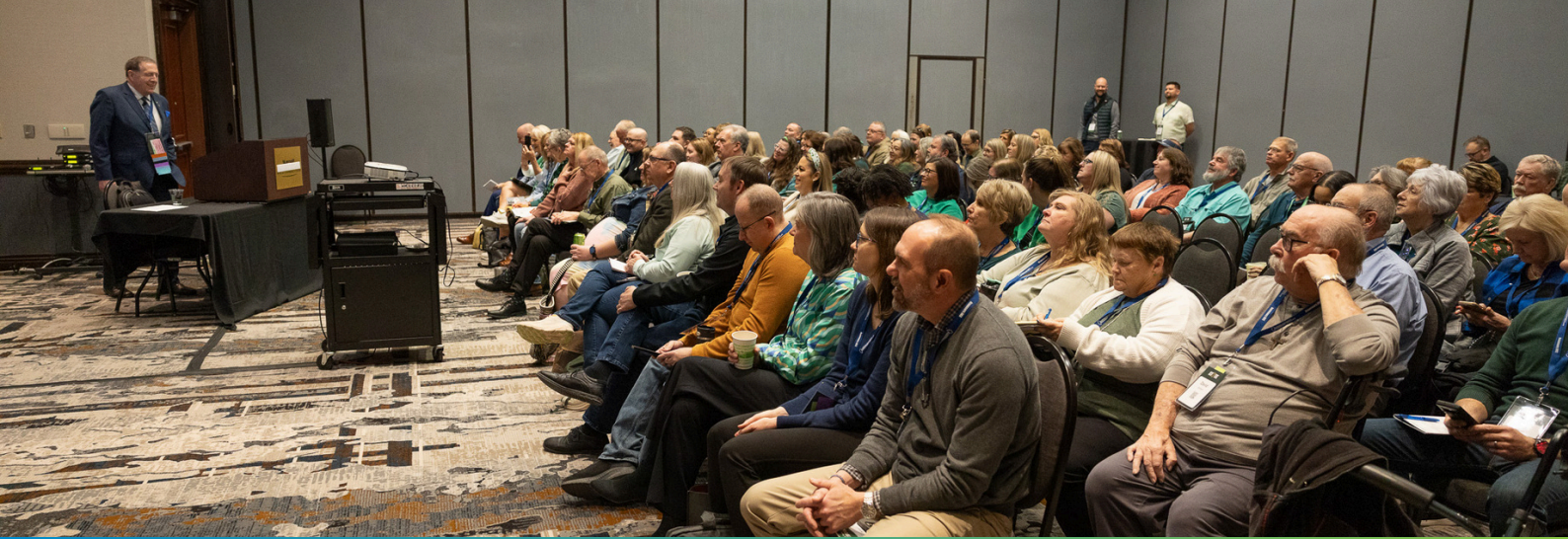
Exhibit Hall Packages

EXHIBIT HALL HOURS: SUNDAY, 6:00–8:00 PM & MONDAY, 7:30 AM–4:00 PM